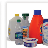
Kitchen, Laundry, Bath: Bottles and Containers empty and replace cap