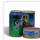
Aluminum and Steel Cans empty and rinse