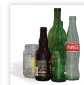
Bottles and Jars empty and rinse without lids